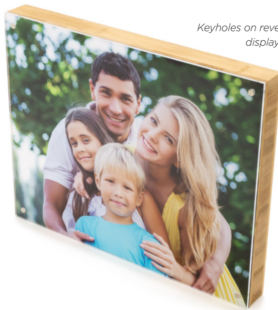
Keyholes on reverse side for displaying on wall.

Bamboo photo frames are the perfect way to display children's artwork, office signs, and anything else you want to rotate regularly.